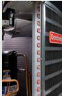
Goodman's SMARTCOIL 5mm tube condensing coil design optimizes the heat transfer ability of R-410A refrigerant compared to standard 3/8" copper tubing.

You can count on your Goodman brand GSX13 Air Conditioner to keep you cool on even the hottest summer days. Your Goodman brand air conditioner starts with an energy-efficient compressor, which operates in tandem with our high-efficiency coil. The coil is made of rifled refrigeration-grade copper tubing and corrugated aluminum fins in a design that maximizes surface area. These high-quality components together cool your home effectively.